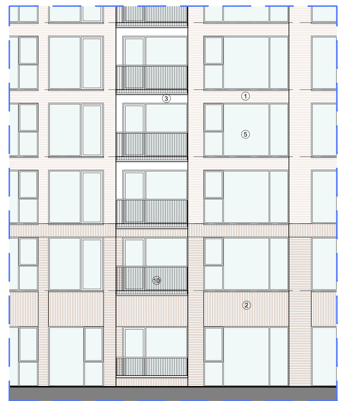
03 FACADE DETAIL P4000 SCALE 1:200 @A1